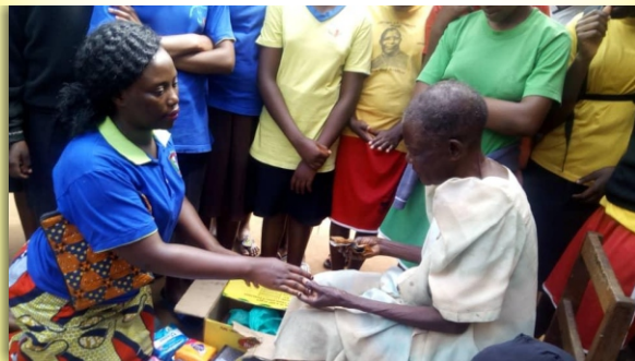
St. Mary's S. S. Nkozi Pro-life Club visiting the elderly.