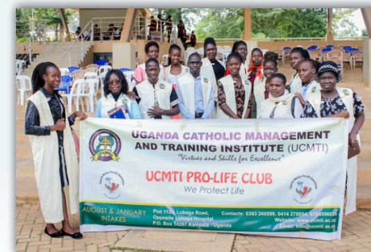
Pro-Life Club committed to promoting a culture of life.