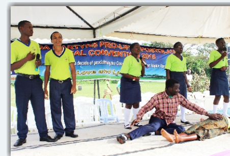
Peer to peer evangelisation through drama.