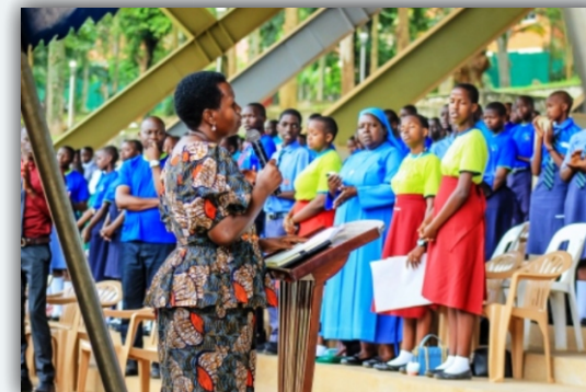
Hon. Lucy Akello addressing students during a Pro-Life Prayer Day at Uganda Martyrs' Shrine Namugongo.